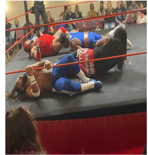
Wrestling champions literally leave it all on the floor (or mat) as the crowd is in awe at the team work.

30 November 2024 was the inaugural wrestling show at Varina Post. To say the event was a great success is an understatement. The show sold out very quickly!!! Wrestling fans packed the house and the energy was so electric you would have thought there were gladiators present. The plan for more wrestling at Varina Post 233 is already in the works. Tickets are on sale now for the next wrestling extravaganza that is taking place on 28 December 2024. Get ready for the Noel Knockout. More events to follow!!!