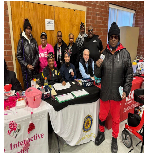
National Salute Week 2-14-25 Supporting Veterans' Health